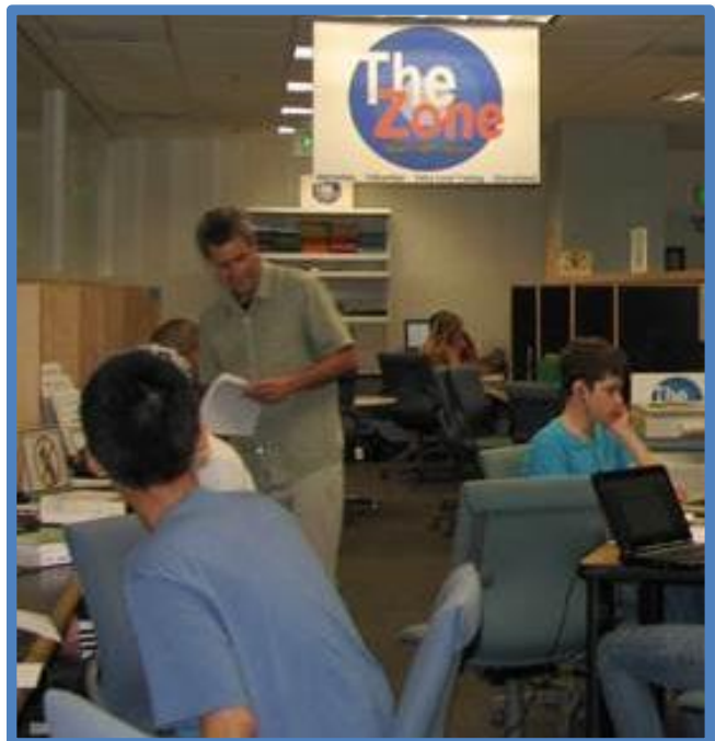
Inside “The Zone” at the Career Center where students can find domestic & international internship, fellowship, volunteer & experiential learning opportunities

The top employers in this list each hired well over 20 new UCLA graduates. It should be noted that almost all of reported employers are actively engaged in many Career Center recruiting activities such as career fairs, campus recruiting, and BruinView™ job listings. Companies utilizing more than one of the Career Center’s recruiting services to hire new UCLA graduates are in blue.