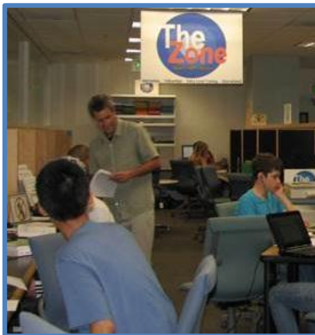
Inside “The Zone” at the Career Center where students can find domestic & international internship, fellowship, volunteer & experiential learning opportunities

The top employers in this list each hired well over 20 new UCLA graduates. It should be noted that almost all of reported employers are actively engaged in many Career Center recruiting activities such as career fairs, campus recruiting, and BruinView™ job listings. Companies utilizing more than one of the Career Center’s recruiting services to hire new UCLA graduates are in blue.